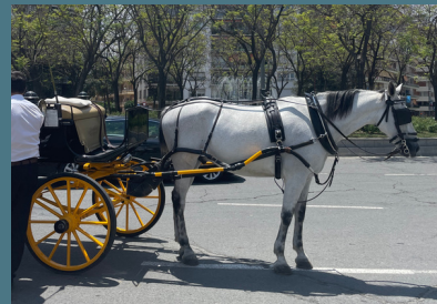
HORSE AND CARRIAGE RIDE THROUGH THE CITY