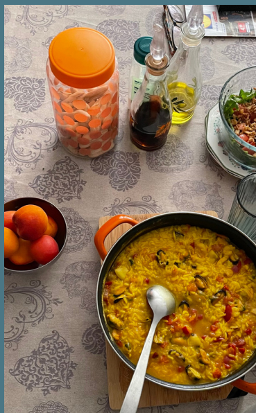
TRY NEW FOODS PREPARED BY MY HOST MOM AND WATCHING THE SPANISH VERSION OF "WHEEL OF FORTUNE" WITH HER