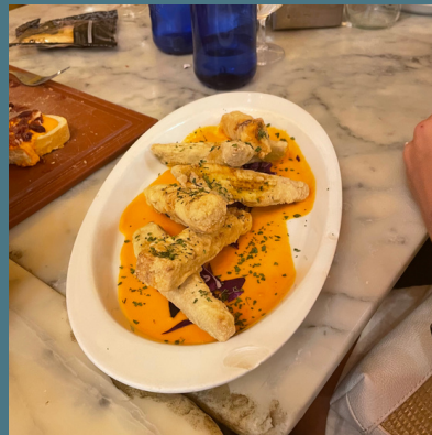
TASTING TRADITIONAL SPANISH TAPAS. OR SMALL DISHES TO BE SHARED WITH FRIENDS