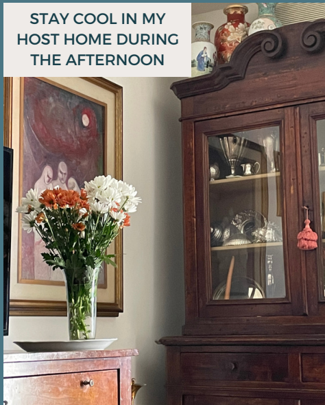
STAY COOL IN MY HOST HOME DURING THE AFTERNOON