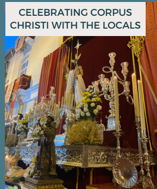
CELEBRATING CORPUS CHRISTI WITH THE LOCALS