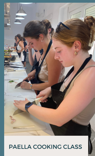
PAELLA COOKING CLASS