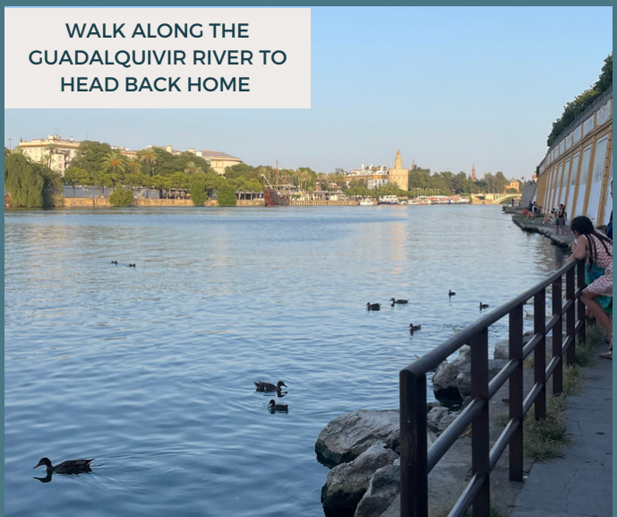
WALK ALONG THE GUADALQUIVIR RIVER TO HEAD BACK HOME