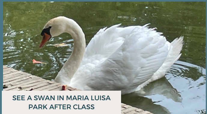
SEE A SWAN IN MARIA LUISA PARK AFTER CLASS