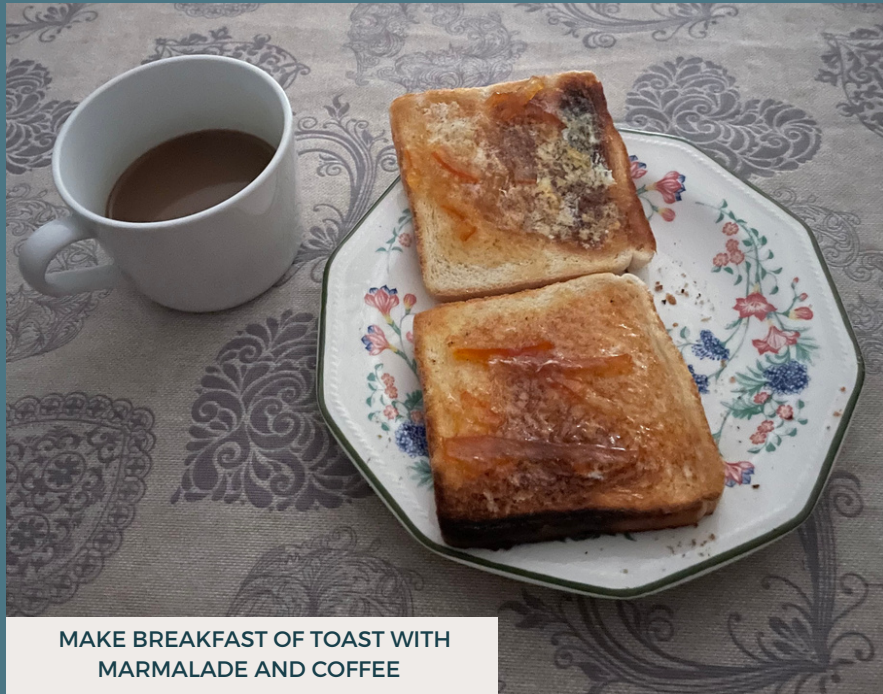
MAKE BREAKFAST OF TOAST WITH MARMALADE AND COFFEE