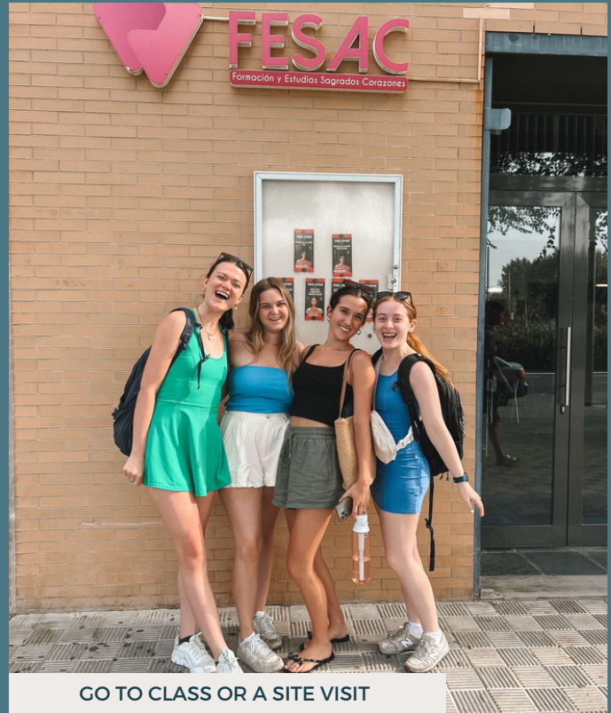
GO TO CLASS OR A SITE VISIT