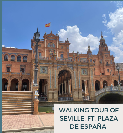
WALKING TOUR OF SEVILLE, FT. PLAZA DE ESPAÑA

ONE MAJOR PART ABOUT STUDYING ABROAD IS GETTING TO EXPERIENCE A NEW CULTURE FIRST HAND. THROUGHOUT MY TRIP, I PARTICIPATED IN ACTIVITIES PLANNED BY GLOBAL ED AND PLANNED SOME OF MY OWN. THIS WAY I WOULD GET TO LIVE LIKE A SPANIARD.