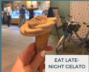
EAT LATE-NIGHT GELATO