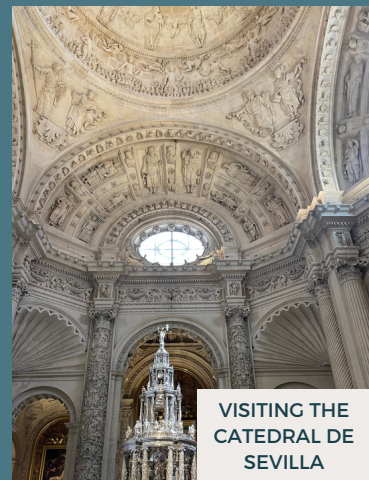
VISITING THE CATEDRAL DE SEVILLA