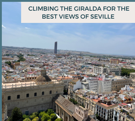
CLIMBING THE GIRALDA FOR THE BEST VIEWS OF SEVILLE